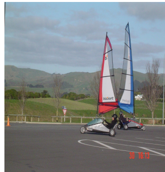
Massey University Carpark

Manawatū blokart club was formed in 2008 with 18 members and was incorporated on the 12 th november 2009, membership had grown to 22 by the 31 st of March 2013.