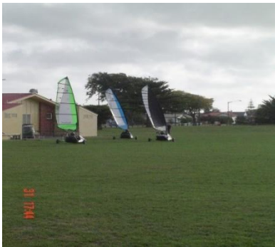
Coronation Park Palmerston North

The first blokart club in the Manawatū was called Top Knots and had approximately 6 - 8 members. They sailed mainly at Coronation Park, Massey University and Foxton Beach.