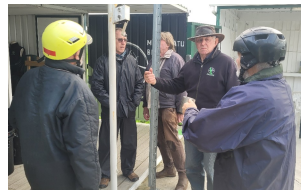
Health & safety conference.